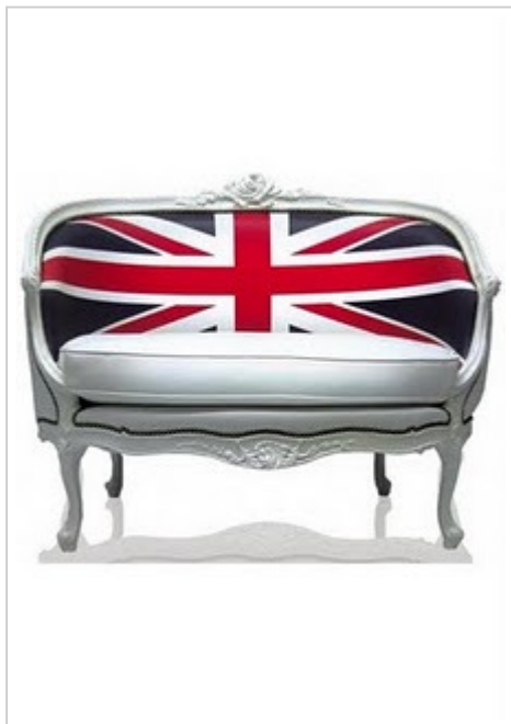
UNION JACK SETTEE