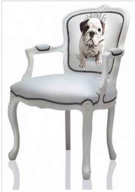
DOGGY QUEEN CHAIR

digital process on them to create amazing eye catching decorative items. I think the photos speak for themselves. Any one of these pieces would infuse a spark of life into any interior. Go to TeoJasmin to see their entire line of products.